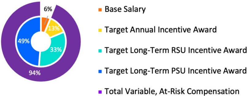
Bernard Kim 2024 Pay Mix

We believe it is important to provide an open forum for stockholder discussion and feedback. As a result, our management regularly engages with our stockholders to hear their perspectives. We greatly value this feedback, and we seek to optimize our executive compensation program by refining our policies, procedures and practices when appropriate.