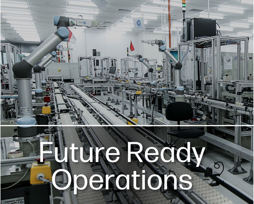
Future Ready Operations