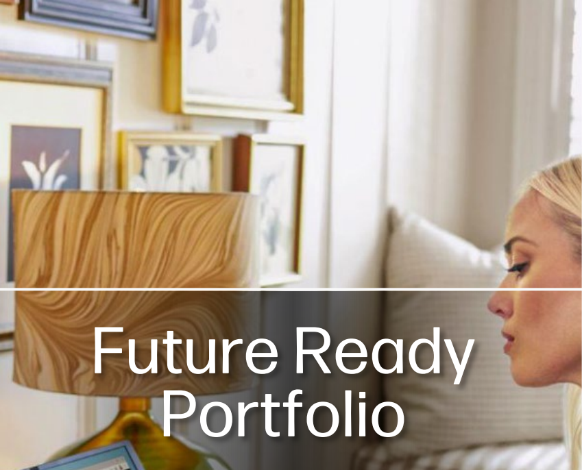
Future Ready Portfolio