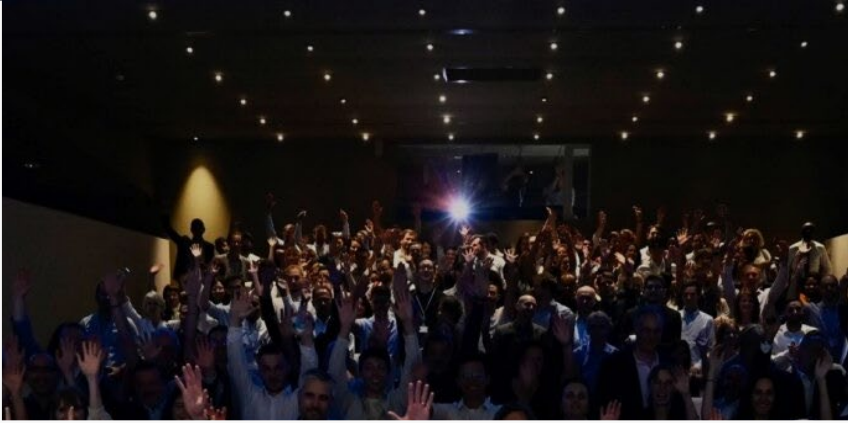
Future Ready People