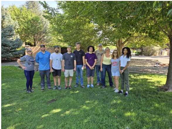
Photo: 2024-07-22 - KTMB Anderson Park Cleanup Group 2