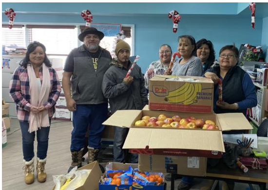
Photo: Holiday Gift Packages for Ft McDermitt Elders

Proper maintenance is not only important for aesthetics; but also improves park safety and the overall visitor experience. In addition to making the park cleaner and more beautiful, the cleanups also help keep paths throughout the park ADA accessible. Thinning out overgrown vegetation enhances the accessibility, safety, and enjoyment of park spaces for visitors.