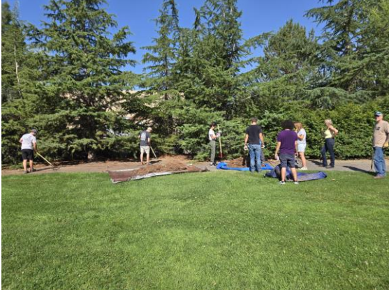
Photo: 2024-07-22 - KTMB Anderson Park Cleanup 1