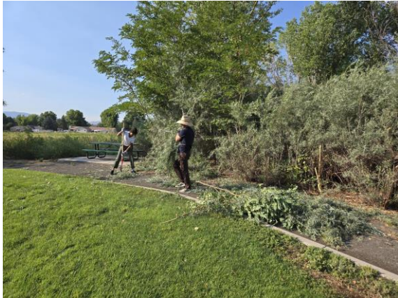
Photo: 2024-07-22 - KTMB Anderson Park Cleanup 3

Proper maintenance is not only important for aesthetics; but also improves park safety and the overall visitor experience. In addition to making the park cleaner and more beautiful, the cleanups also help keep paths throughout the park ADA accessible. Thinning out overgrown vegetation enhances the accessibility, safety, and enjoyment of park spaces for visitors.