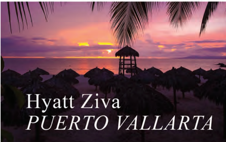
Hyatt Ziva PUERTO VALLARTA

Spanning 1,200 feet of private, pristine coastline on the turquoise Caribbean Sea, HYATT ZILARA ROSE HALL and HYATT ZIVA ROSE HALL share the same resort grounds, combining to form an unparalleled all inclusive resort experience. Hyatt Zilara Rose Hall is an indulgent, sophisticated and stylish escape exclusively for adults, featuring adult-oriented amenities and gourmet dining and lounges. Hyatt Ziva Rose Hall treats guests of all ages to rest, relaxation and recreation with five swim up pools and three whirlpools, gourmet gastronomy and an innovative children’s program.