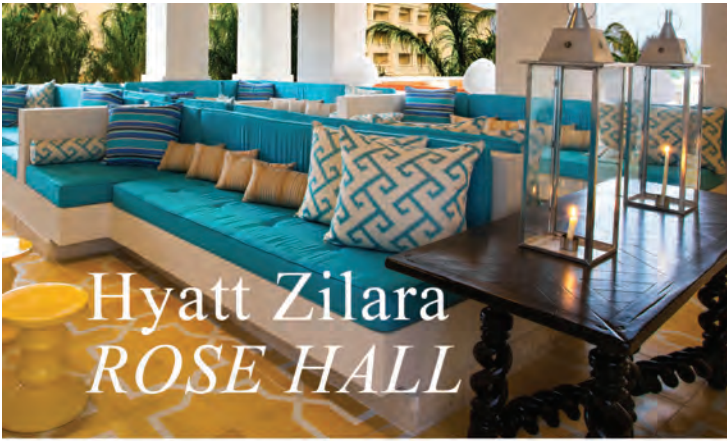
Hyatt Zilara ROSE HALL