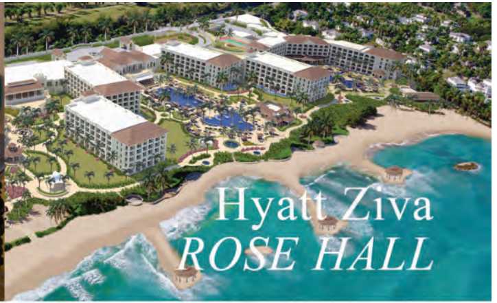
Hyatt Ziva ROSE HALL