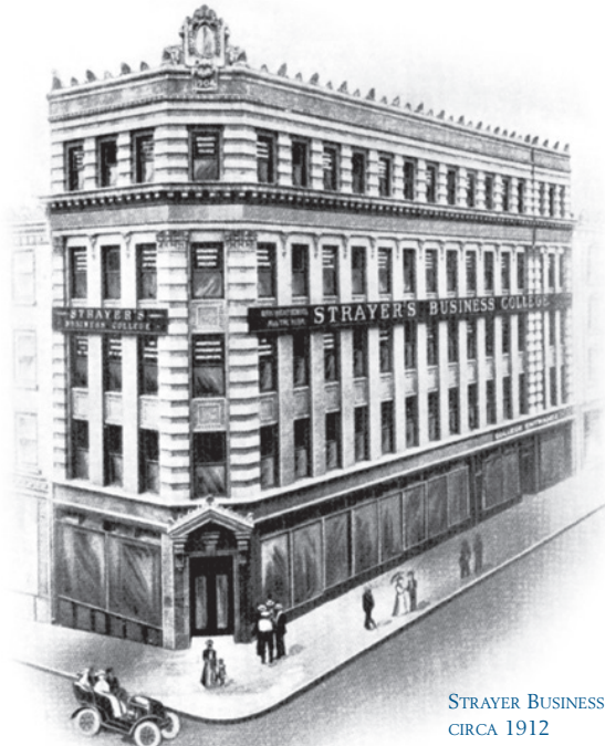
STRAYER BUSINESS COLLEGE CIRCA 1912

Finally, in presenting this catalog, we want to thank a discerning public for its support, and assure it that we shall endeavor to continue to merit the bountiful confidence it has heretofore placed in us.