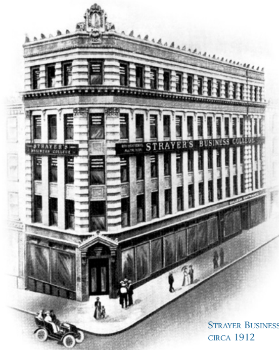
STRAYER BUSINESS COLLEGE CIRCA 1912

Finally, in presenting this catalog, we want to thank a discerning public for its support, and assure it that we shall endeavor to continue to merit the bountiful confidence it has heretofore placed in us.